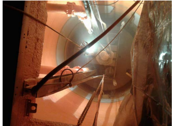
Crews from ARS Complete Liner at PS-6 at Entrance to Sunrise Park

With the Cycling of Employees and reduced staff we have met and completed all normal maintenance activities, including daily checks of all water system towers and booster stations, weekly checks and inspections of all lift stations performed daily lab analysis for the water and waste water treatment plants, performed all meter reading and billing on time, and completed all MISS DIG Utility Staking as normal.