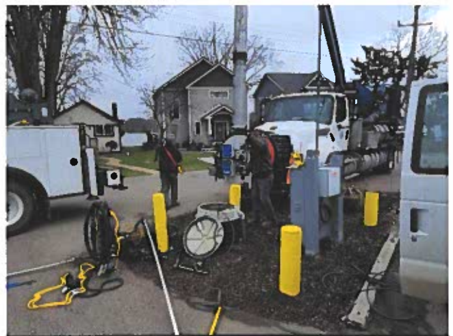
Staff Installs New Pumps at Station 29 In Sunrise Park

Our employees, from Administrative Personnel to Water and Waste Water Operators are working modified schedules with varying rotating weeks. This allows staff to complete all necessary tasks and maintenance while keeping staff out of contact should someone become infected or if additional help is needed. We have beefed up PPE requirements; however in working with waste water, we were pretty good at disease prevention as a standard practice. We have gone to daily cleaning of plants